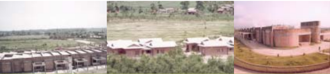
Verious Units Under Construction

commissioned a state of the art cigarette manufacturing plant from Korea and started producing and selling high quality cigarettes, Pine lights in technical collaboration with Korea's tobacco giant KT&G Corporation.