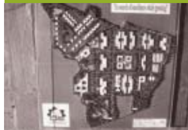
The Master Plan