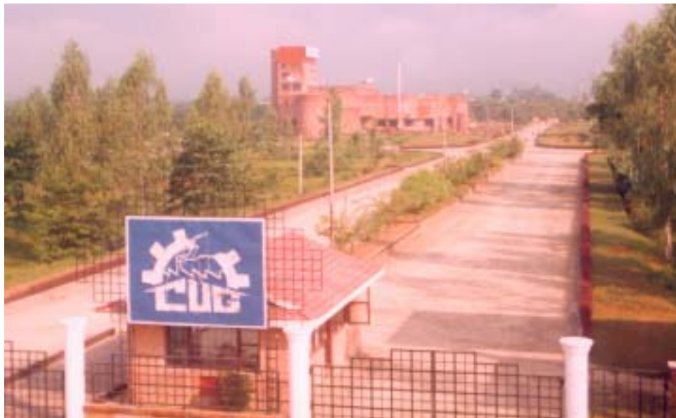
The main entrance and SBN Block

The facilities in the industrial village are supported by a Learning Centre, a Medicare Centre, customized housing facilities, an upcoming CG Kanchi Shankaracharya Temple and a nine hole Golf a Course. The environmental is considerably improved by its agro forestry .Ganga Devi Chaudhary Udyog Gram has grown significantly by including facilities that lead to holistic development instead of merely being a group of factories located within one area. ■