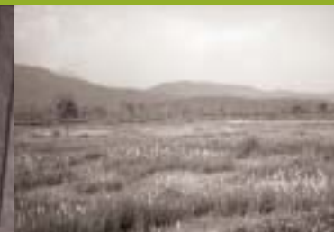
The Chosen Land