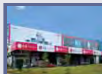
COVER PHOTO: STARLEC