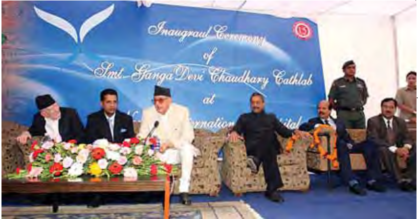
PM Koirala delivering his speech at the function